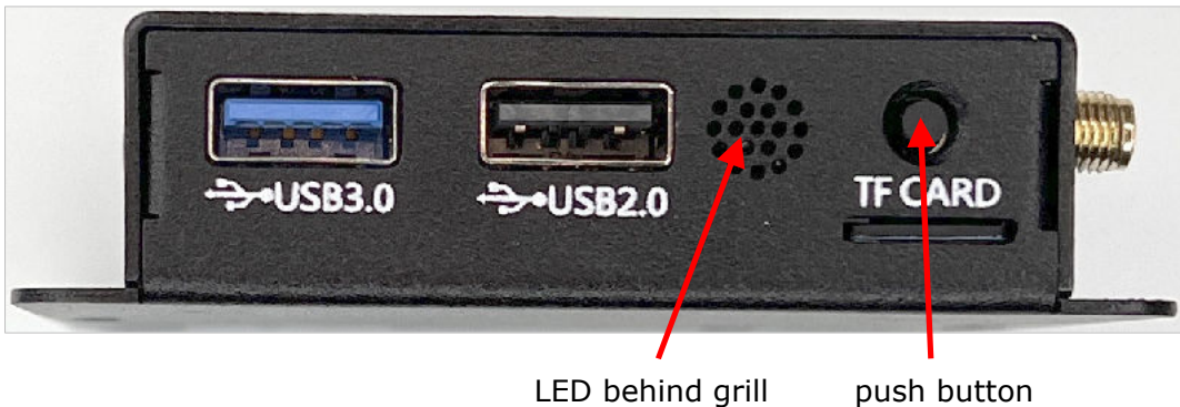
Figure 1 : ANT-37500 "front" panel

The ANT-37500 can be factory reset by using the small button on the front panel, as shown in Figure 1.