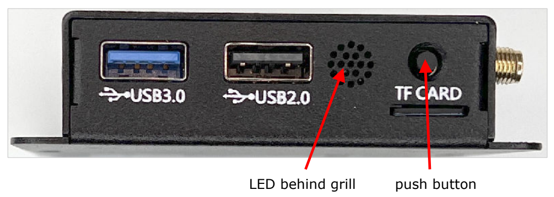
Figure 1 : ANT-37500 "front" panel

The ANT-37500 can be factory reset by using the small button on the front panel, as shown in Figure 1.