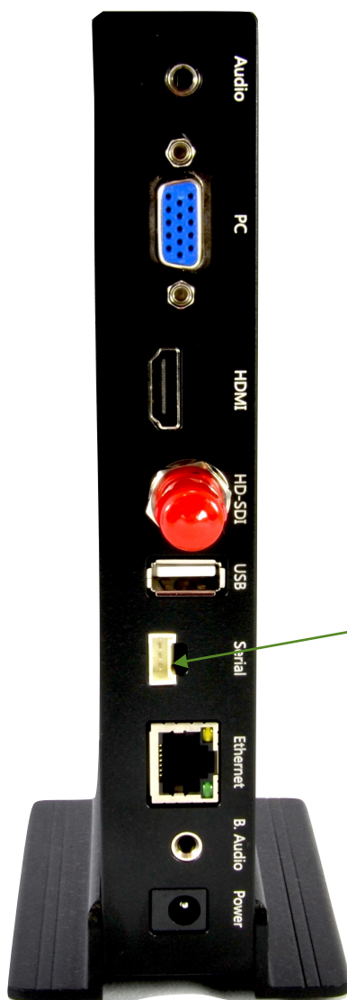
Serial Connector Pin Assignments of the ANT-6000E/ANT-6000D